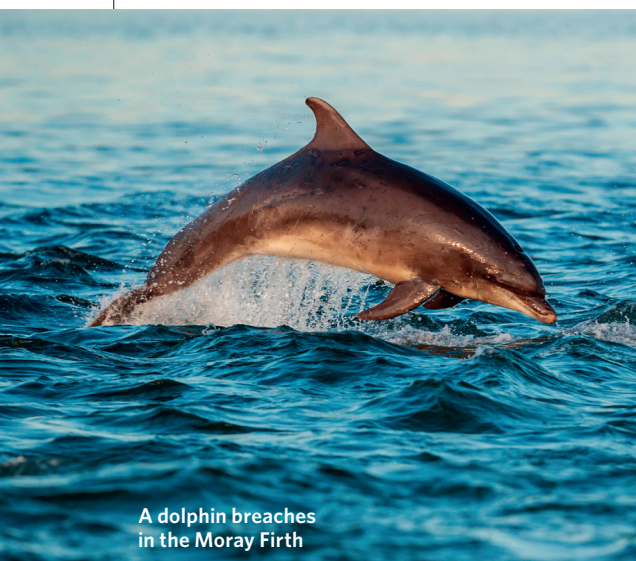
A dolphin breaches in the Moray Firth

Julia Bradbury shares her favourite unforgettable wildlife moments from years spent touring both in the UK and abroad