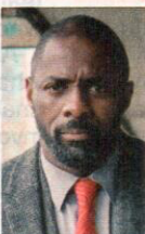
Welcome back... Popular Luther

Luther's tense return on Tuesday had 5m on the edge of their seats. The start of the BBC1 thriller knocked 300,000 off ITV documentary Secrets from the Workhouse at 9.00pm, which dropped from 3.1m to 2.8m in a week.