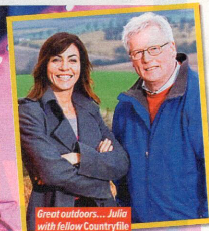
Great outdoors... Julia with fellow Countryfile presenter John Craven