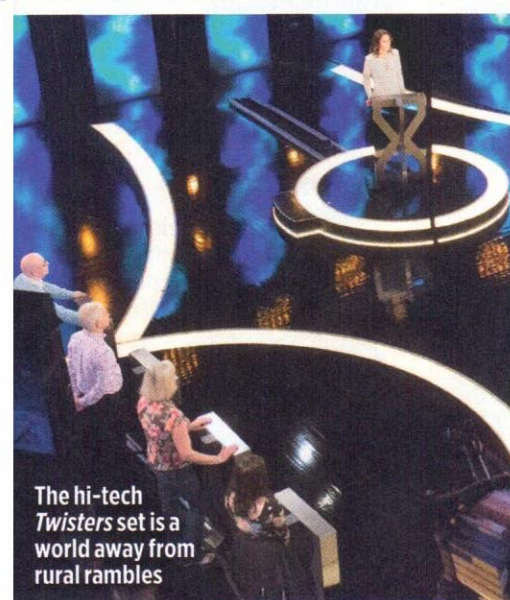
The hi-tech Twisters set is a world away from rural rambles

she grew up, has just finished filming 30 episodes of the show when we chat to her. She describes herself as a 'massive fan' of quiz shows, citing Deal or No Deal as having a brilliant format and Who Wants to Be a Millionaire? host Chris Tarrant as 'the quizmaster extraordinaire'. 'He's The Dude. He really is The Dude.'